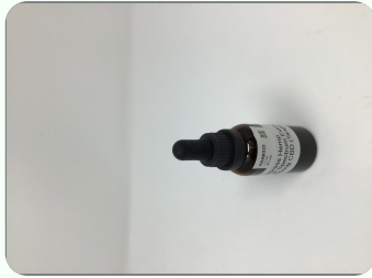
The photos on this report are of a sample collected by the lab and may vary from the final packaging.